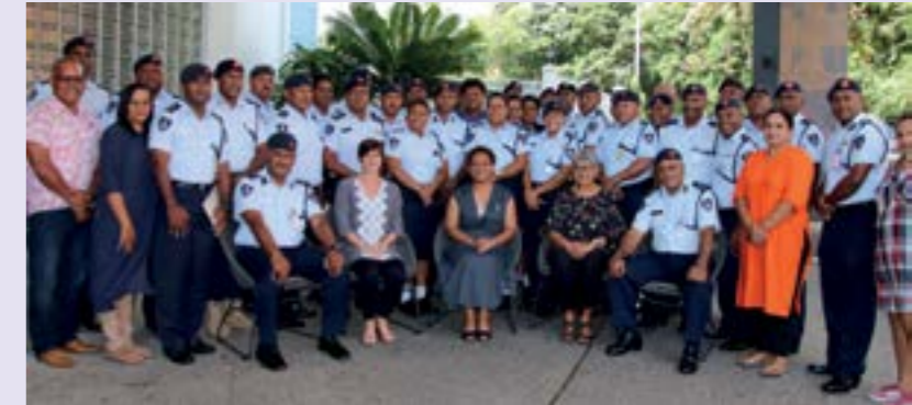
Minister for Women Mereseini Vuniwaqa closed the five-day Gender, Violence Against Women & Girls and Human Rights training facilitated by the Fiji Women's Crisis Centre for the Southern Division Police Command Group.