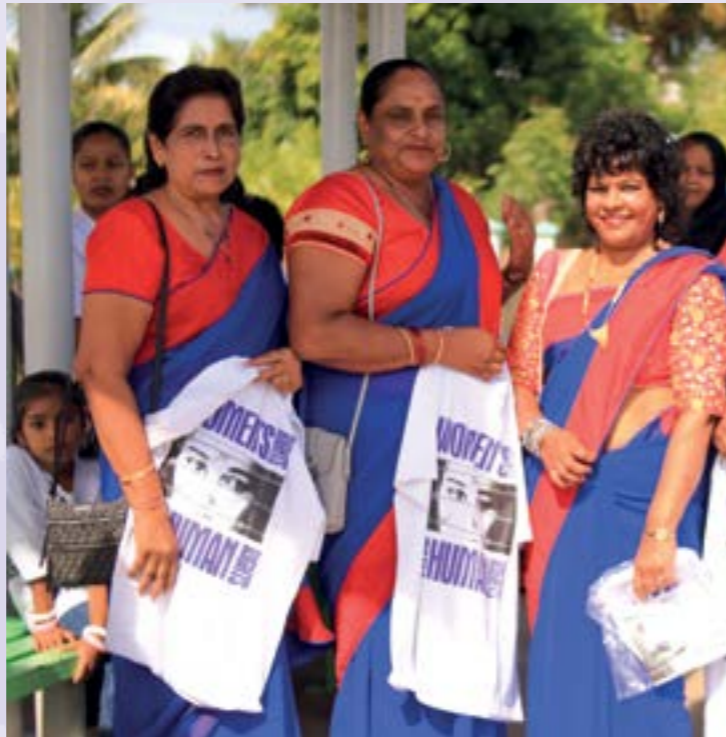
Women from a Nadi-based community group during the 16 Days of Activism program organised by the Nadi WCC last year.