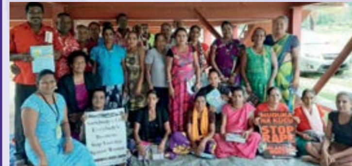
Staff members from the Labasa Women's Crisis Centre spoke to women and men from the Wainikoro cane farming community on issues surrounding Violence Against Women & Girls and Human Rights. The awareness session was organised by the Labasa Cane Producers Association.