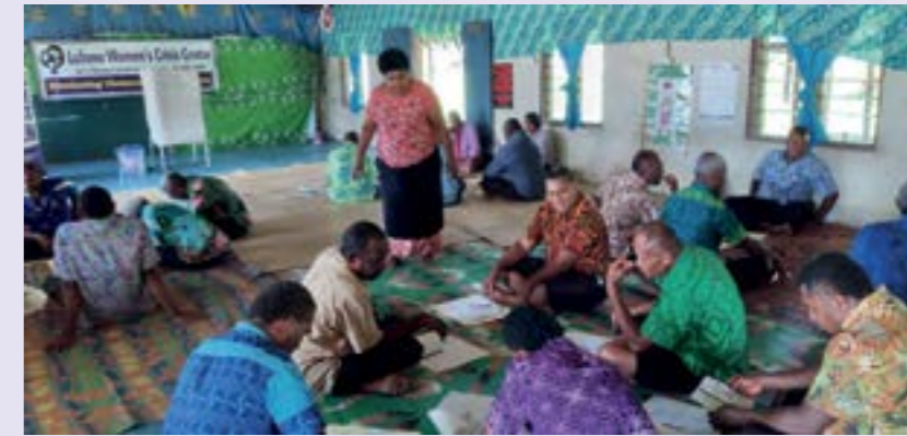
The Labasa Women's Crisis Centre conducted a five-day male advocacy training on violence against women and girls, gender and human rights for the Tikina Saqani in Savusavu.