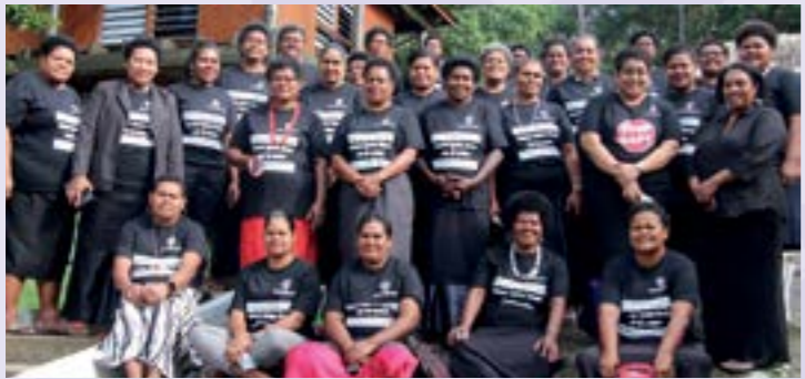
Participants of the Gender, Violence Against Women & Girls and Human Rights training. They are representatives of the Soqosoqo Vakamarama from Naitasiri, Korovou, Nausori, Nakasi, Levuka & Gau at Nadave.