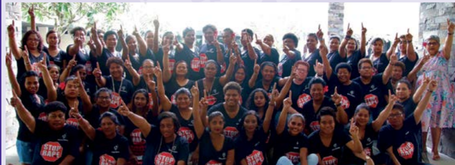
FWCC staff marked the One Billion Rising Campaign on February 14 during their 2020 retreat.