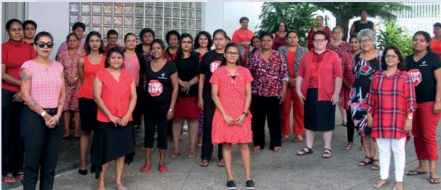
FWCC in solidarity with the people of West Papua on a Wednesday at Suva's Tanoa Plaza Hotel.