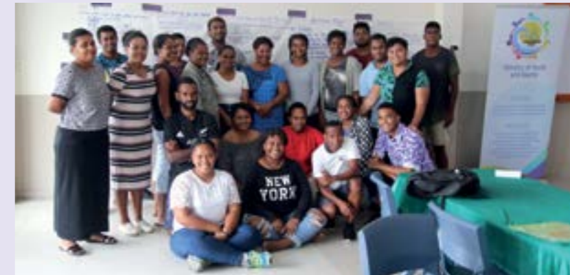
FWCC was invited by the Ministry of Youth and Sports to conduct a training for various youth clubs in Nausori.