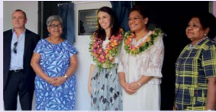
Official opening of the Nadi WCC building by the Prime Minister of New Zealand, Rt Hon Jacinda Ardern.