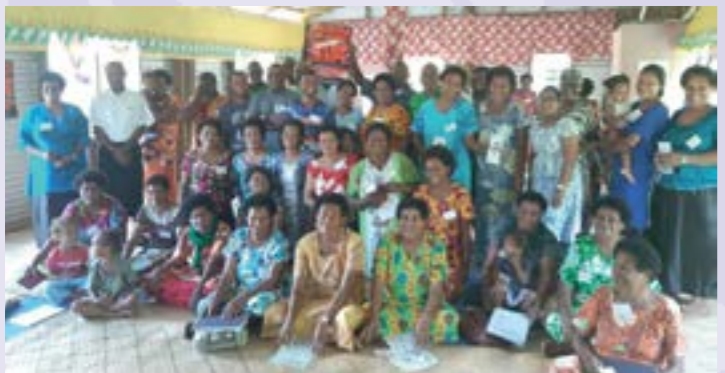
Staff members from the Labasa Women's Crisis Centre with participants from the gender-based violence awareness session at the House of Sarah at Nabunikadamu village, Wainunu, Bua.