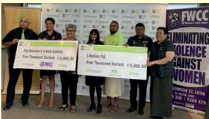
The Fiji Women's Crisis Centre and Lifeline Fiji received a donation from the BSP Group for its shelter projects. Lifeline Fiji was another beneficiary.