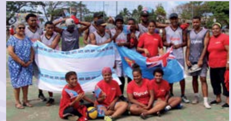
Suva Volleyball Association team members during their Fiji Day volleyball tournament in October. FWCC supported the Suva Volleyball Association throughout the year.