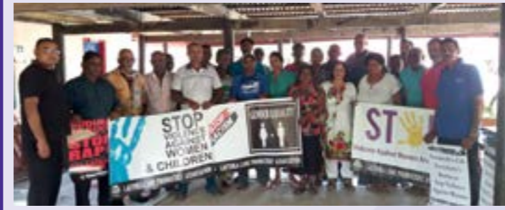
Nadi Women's Crisis Centre conducted an awareness session for the Olosara farming community in Sigatoka on Violence Against Women & Girls.