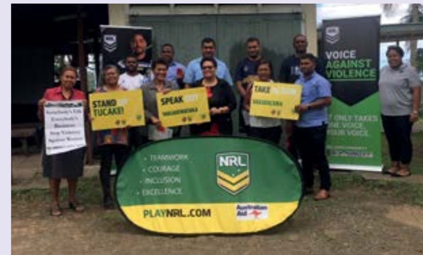
FWCC has supported the Fiji National Rugby League Voice Against Violence Program throughout the year.