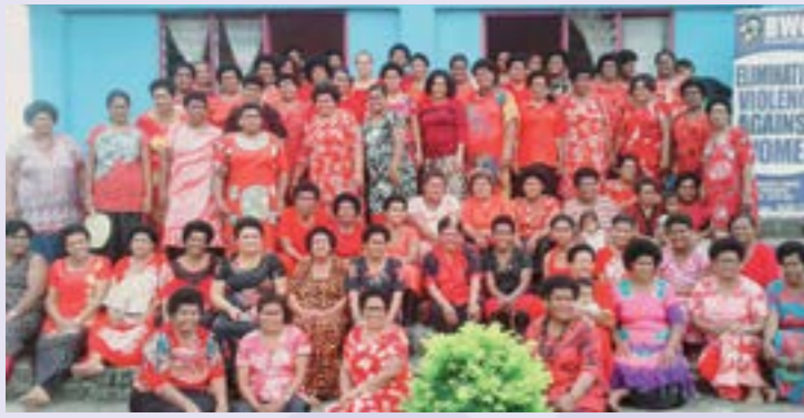
Ba Women's Crisis Centre conducted a training workshop for 90 women at Korovou Village, Tavua.