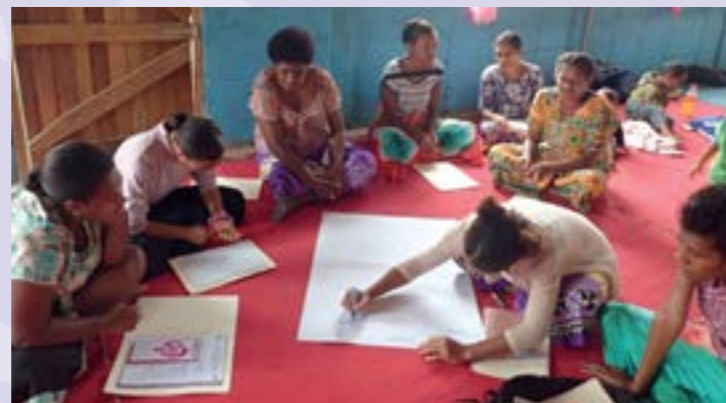
Rakiraki Women's Crisis Centre conducted a five-day training on Gender, Violence Against Women & Girls and Human Rights at Namara Village in Ra for 30 women from the five villages of Tikina Lawaki.