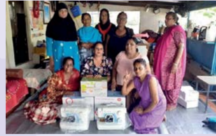
Members of the Manoca Housing Mothers Club received two sewing machines from FWCC to support them as part of COVID response work.