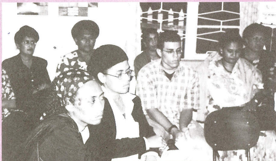
Media representatives at the discussion

The response that the media representatives present at the discussion gave in relation to the above is what makes front page depends on what is newsworthy at the time and also what the public wants to read. The outcome of the presentation was a positive and encouraging one. However, there is still a dire need to continue lobbying for media to adopt a policy of gender sensitivity.