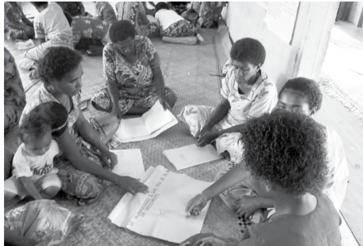
Naluwai Women's Group, Naitasiri