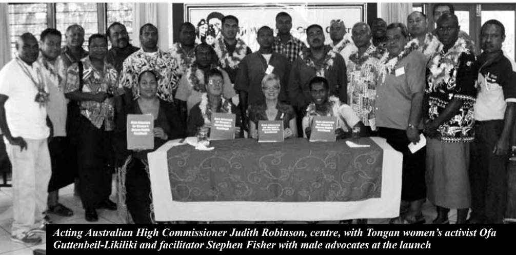
Acting Australian High Commissioner Judith Robinson, centre, with Tongan women's activist Ofa Guttenbeil-Likiliki and facilitator Stephen Fisher with male advocates at the launch

The figures mirror the statistics collated by the Fiji Women's Crisis Centre since data collection started in 1985.