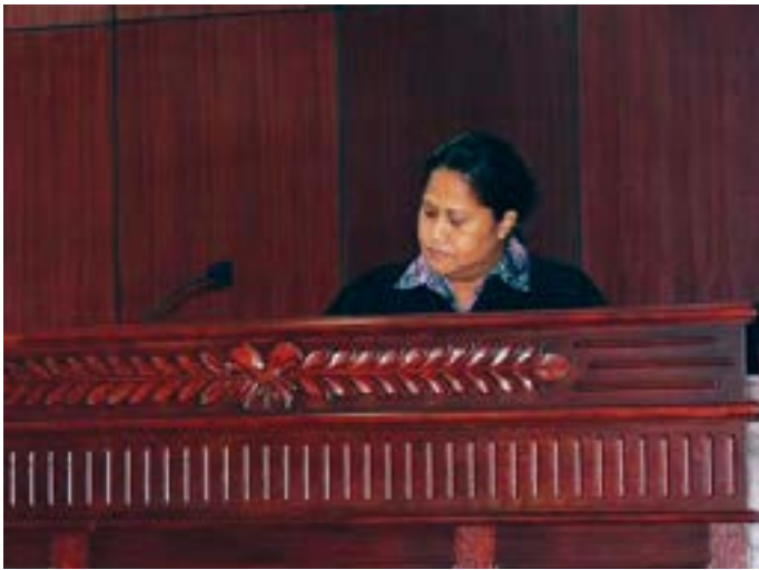
Newly-appointed Samoa Supreme Court judge Mata Tuatagaloa.