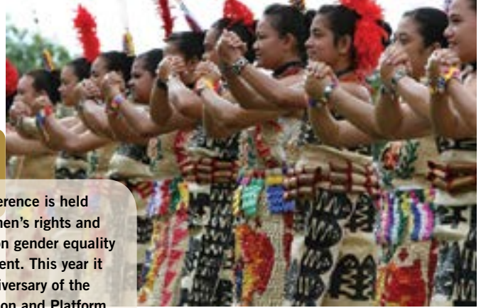
Cultural dance display during CEDAW protest in Tonga

The Women and Children Crisis Centre (WCCC) in Tonga has been challenging these myths and misconceptions in the hope that a better understanding is created among the wider public.