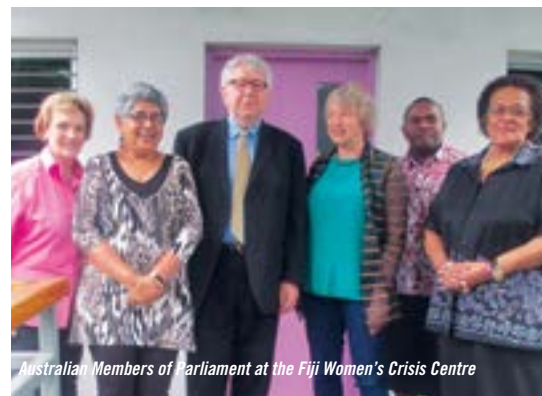
Australian Members of Parliament at the Fiji Women's Crisis Centre

The Senators acknowledged the Centre's work and assured their full support.