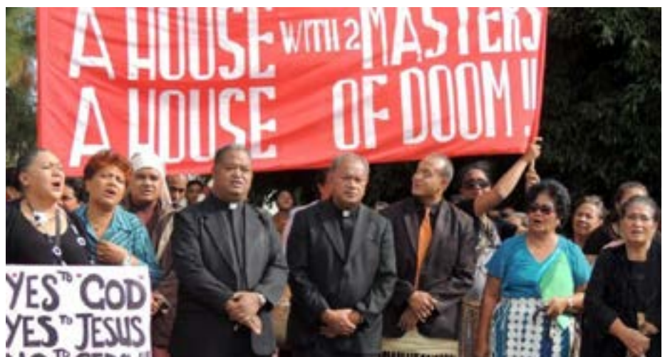
CEDAW protest march in Tonga

189 countries have ratified CEDAW. There are only seven countries left to ratify including two from the Pacific: Palau and Tonga. It contains 30 articles with the first 16 being the substantive articles covering the definition of discrimination, health, education, work life, economic opportunities, political representation, public life, marriage life, rural women, human rights, nationality, temporary special measures, laws and policies to end discrimination, trafficking and prostitution and social cultural attitudes and behaviours.