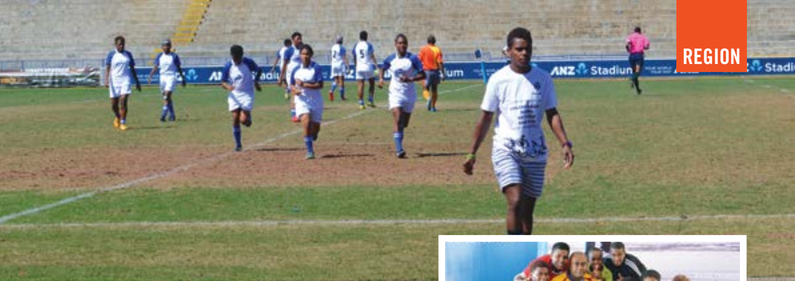
FWCC sponsored schools representing Tonga (St Vincent College) and Samoa (Jasper Williams High School)