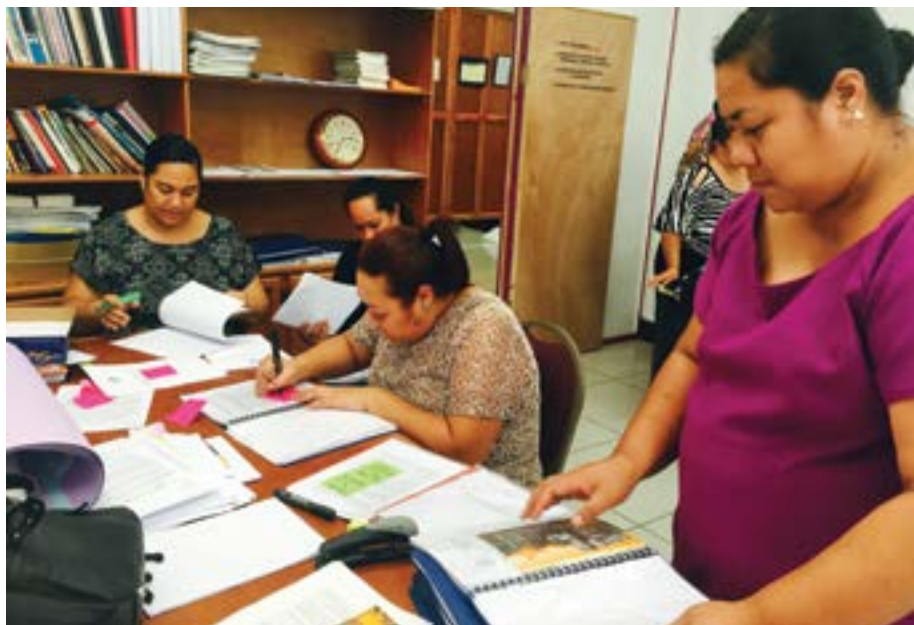
CEDAW Coalition members at work