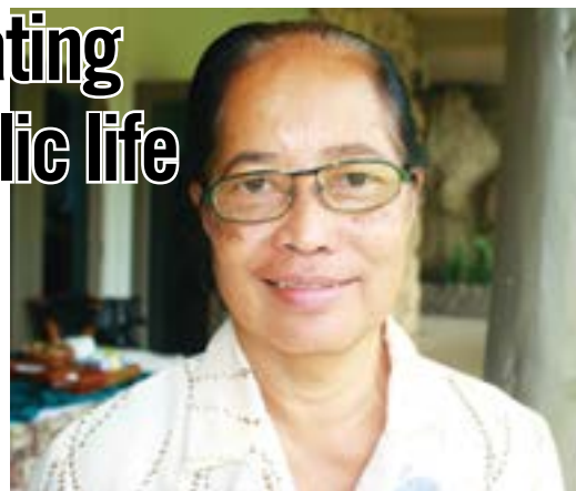
Senator Magdalena Walter

"We are the ones that fight for true democracy, for good governance and for gender equality. There are some men out there, very few