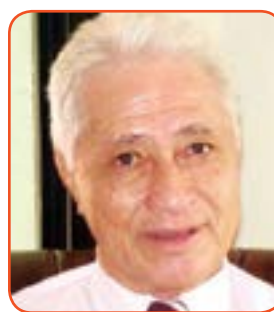
Samoan Ombudsman Maiava Iulai Toma

number of recommendations made to relevant government ministries and agencies in order to better strengthen human rights protections for the people of Samoa. "As Samoa continues to develop and prosper, more needs to be done to ensure quality health care is available and accessible for all Samoans," Tuilaepa said.