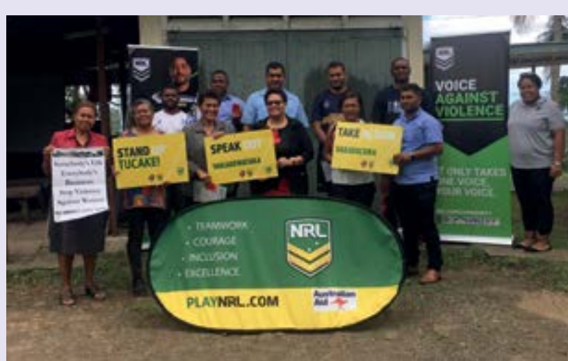
FWCC has supported the Fiji National Rugby League Voice Against Violence Program throughout the year