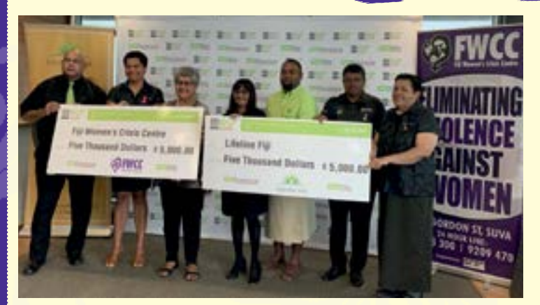
The Fiji Women's Crisis Centre and Lifeline Fiji received a donation from the BSP Group for its shelter projects. Lifeline Fiji was another beneficiary.