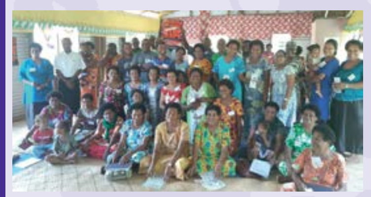
Staff members from the Labasa Women's Crisis Centre with participants from the genderbased violence awareness session at the House of Sarah at Nabunikadamu village, Wainunu, Bua.