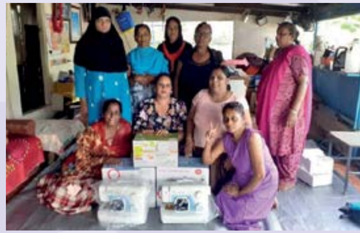
Members of the Manoca Housing Mothers Club received two sewing machines from FWCC to support them as part of COVID response work.