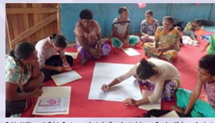
Rakiraki Women's Crisis Centre conducted a five-day training on Gender, Violence Against Women & Girls and Human Rights at Namara Village in Ra for 30 women from the five villages of Tikina Lawaki.