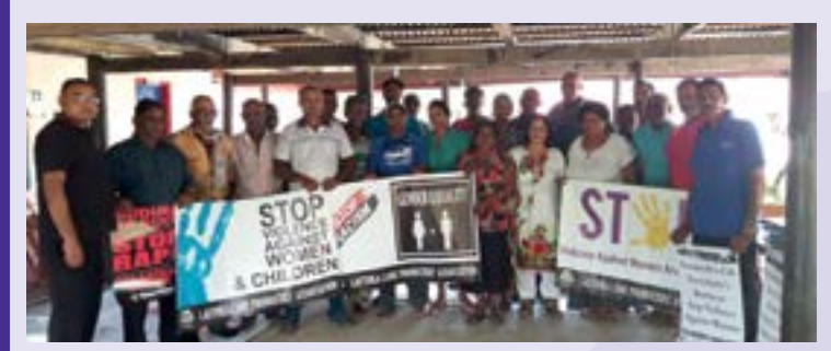
Nadi Women's Crisis Centre conducted an awareness session for the Olosara farmin community in Sigatoka on Violence Against Women & Girls.