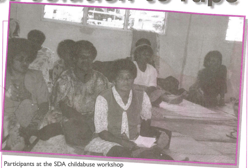
Participants at the SDA childabuse workshop