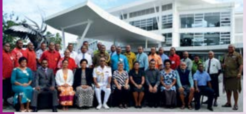
Republic Of Fiji Military Forces Senior Officers after attending a 5-day training facilitated by FWCC at The Pearl Resort and Spa.