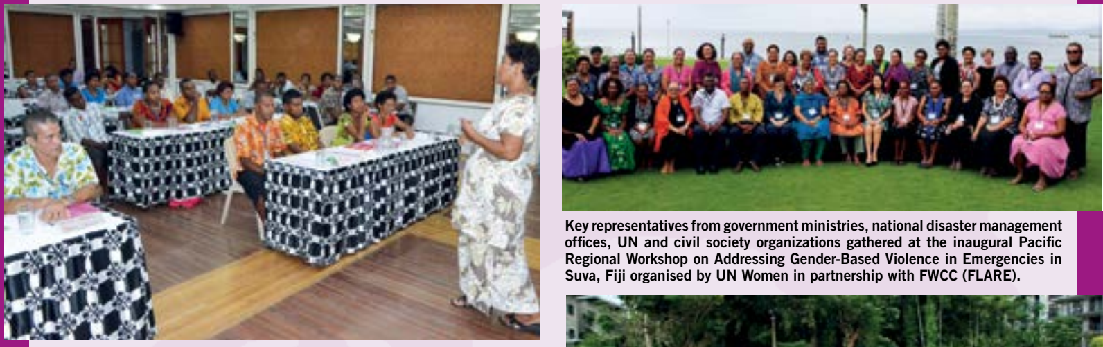
Eastern Division youths during a 5-day training facilitated by FWCC organised in collaboration with the Ministry of Youth and Sports.