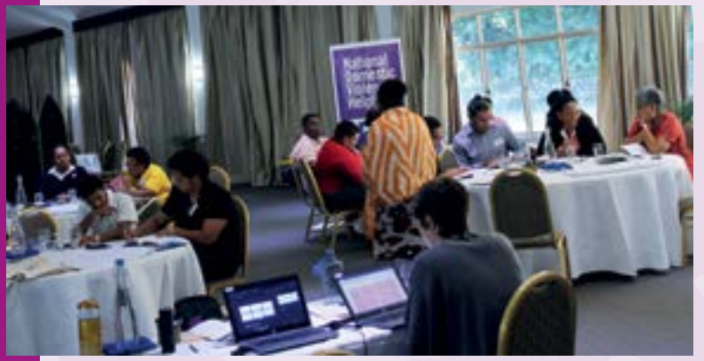
nts during the drafting of the Fiji National Service Delivery Protocol for Responding to Cases of Gender Based Violence - Standard Operating Procedures for Interagency Response Among Social Services, Police, Health and Legal/Justice Providers