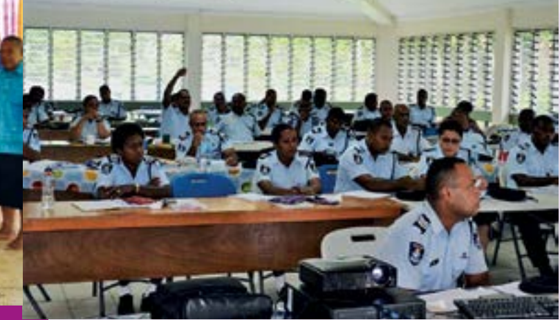
Fiji Police Force undergoing training facilitated by FWCC.