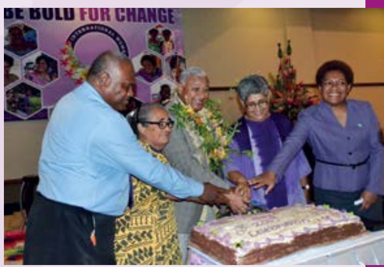
Launching of the first Domestic Violence Toll-Free Helpline (1560) and also commemorating International Women's Day.