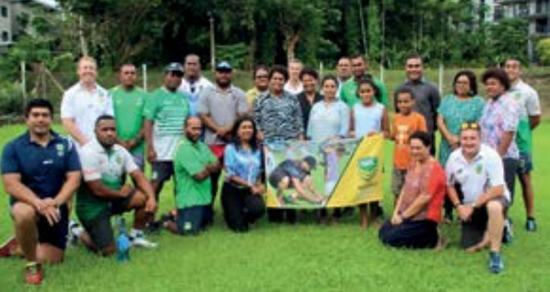
NRL Players with FWCC staff after an awareness session facilitated by FWCC.