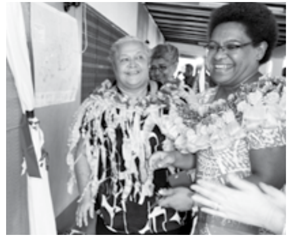
Minister for Women, Children and Poverty Alleviation Mereseini Vuniwaqa symbolically opens the new LWCC building while MFAT's Faga Semisi looks on