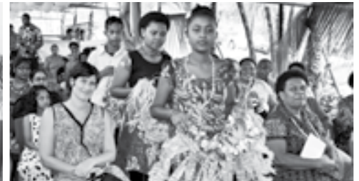
Guests at the opening of the Labasa Women's Crisis Centre premises at Naiyaca Subdivision on Friday 25 November, 2016

government was proud to have supported the work of the Fiji Women's Crisis Centre for most of its